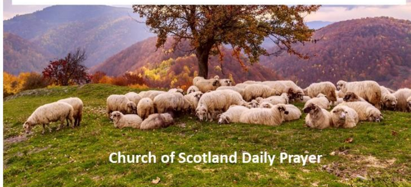
Church of Scotland Daily Prayer

Give us the confidence to believe that at turning points, beginnings and endings, You watch over us, even if just out of sight. For you are God, and at no-one's beck and call. We do not have to find You, for You have found us. Glory be to You, O Lord.